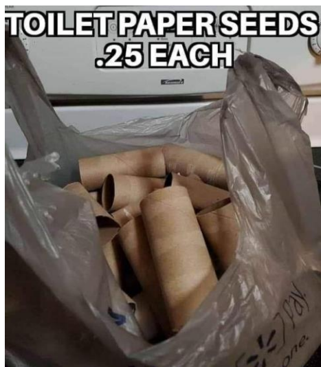
Charmin Farmin Just sprouted. Ready in 3 weeks.